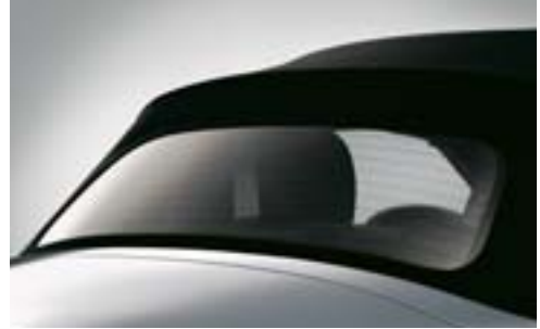
■ Heated, glass rear window and easy, one-hand release/lock operation allow the softtop to make the Z4 Roadster into a comfortable all-weather car. Thanks to a functional folding sequence, the softtop's front section doubles as a tonneau cover and lies flush for a neat appearance. When the top is up, its variable storage compartment can be used to stow added cargo.