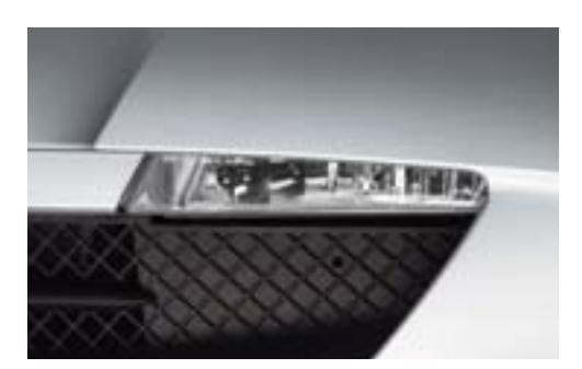
■ Foglights are newly designed and neatly integrated into the front air dam, providing uniform illumination in bad weather conditions.