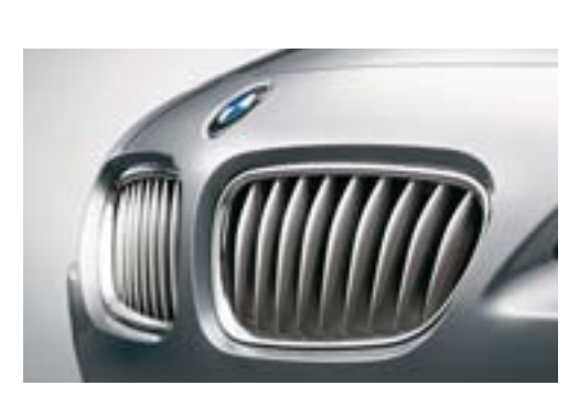
■ "Kidney" grille, the signature design item that makes all BMWs so easily recognizable, is recessed on the Z4 Roadster.