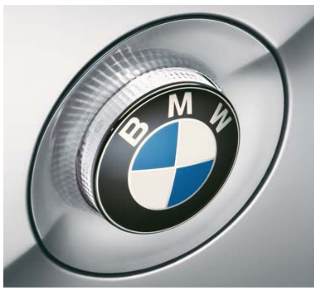
■ Side indicator lights with white lenses. When flashing, the light radiates outward from behind BMW's signature roundel.