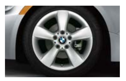
☐ 17 x 8.0 front/17 x 8.5 rear Star Spoke (Styling 105) light-alloy wheels and 225/45R-17 front, 245/40R-17 rear run-flat¹ performance tires.² (incl. in opt. Z4 Roadster 3.0i Sport Package)