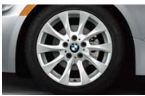
■ 17 x 8.0 Turbine (Styling 201) light-alloy wheels and 225/45R-17 run-flat¹ all-season tires. (Z4 Roadster 3.0si)