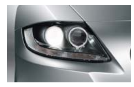
☐ Xenon headlights illuminate the road ahead and to the side with brilliant clarity. These lowand high-beam headlights provide greater road-side detail when driving at night.