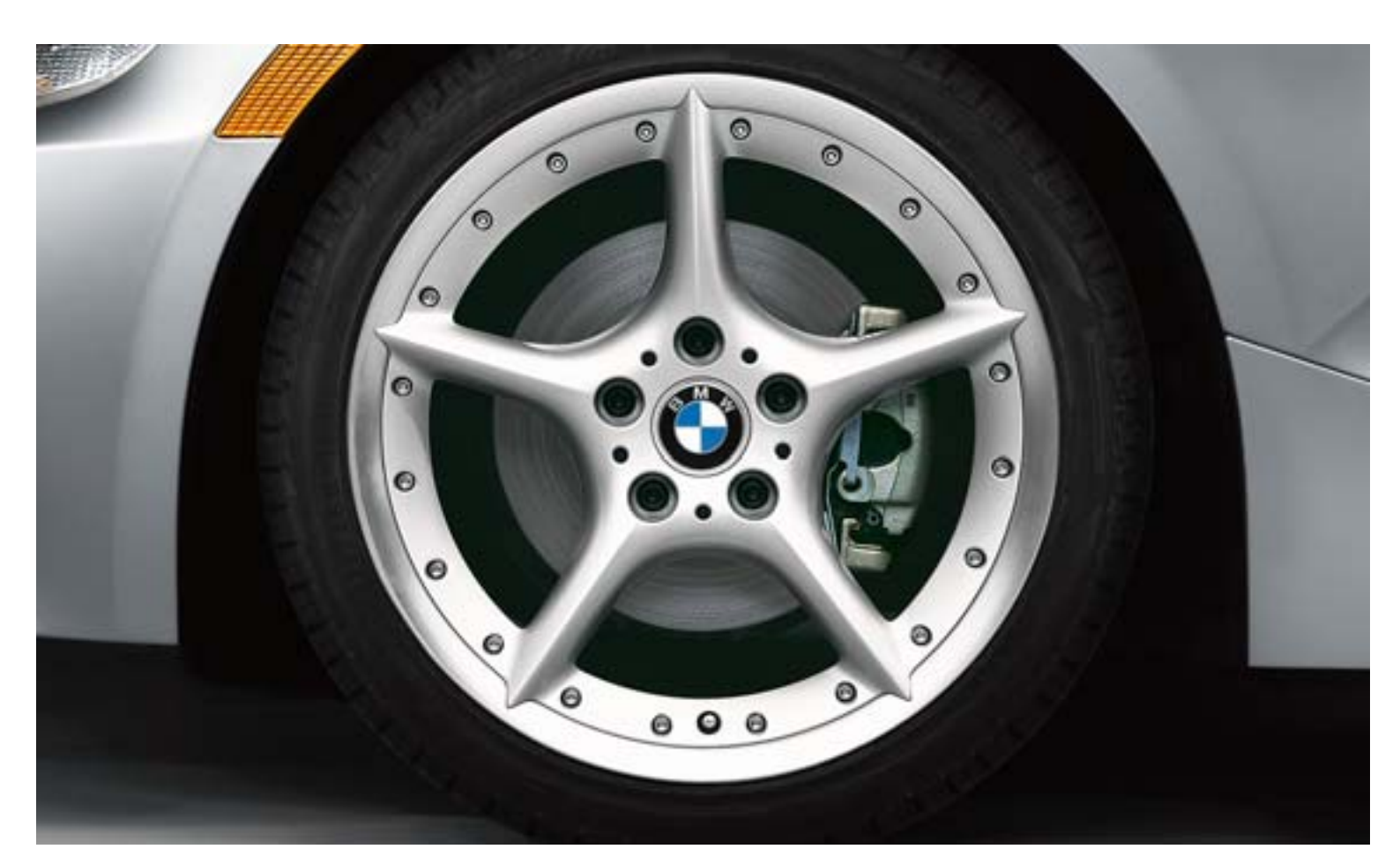
□ 18 x 8.0 front/18 x 8.5 rear Bolted Star Spoke (Styling 108) light-alloy wheels and 225/40R-18 front, 255/35R-18 rear run-flat¹ performance tires.² (incl. in opt. Z4 Roadster 3.0si Sport Package)