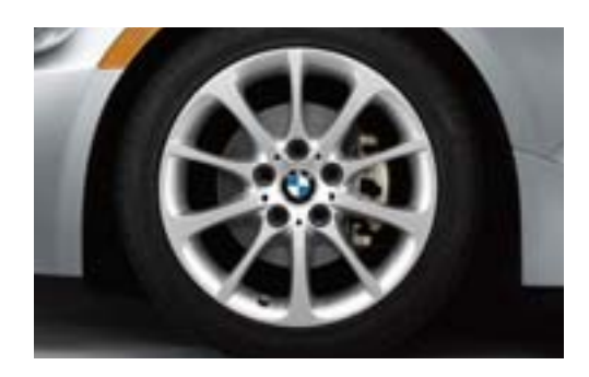
■ 17 x 8.0 Star Spoke (Styling 200) light-alloy wheels and 225/45R-17 run-flat¹ all-season tires. (Z4 Roadster 3.0i)